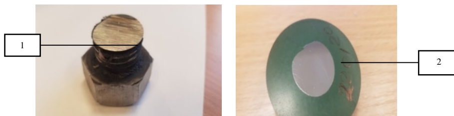
Fig. 3. Determination of the hardness of the bolt: 1 – broken bolt; 2 – new bolt

At the third stage of the study, the chemical composition of the metal of the broken bolt and the new bolt (Fig. 4) were analyzed. To determine the chemical composition of the metal, we used the PMI optical emission analyzer - Master PRO, working on the principle of local burning of the sample surface with subsequent determination of the chemical composition and output of the obtained data to a printing device. The results of the analysis of the chemical composition of the sample are shown in Table 2.