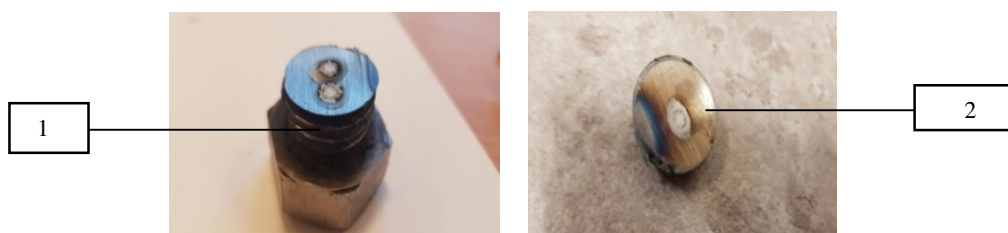
Fig. 4. Determination of the chemical composition of a bolt: 1 – broken bolt; 2 – new bolt

At the third stage of the study, the chemical composition of the metal of the broken bolt and the new bolt (Fig. 4) were analyzed. To determine the chemical composition of the metal, we used the PMI optical emission analyzer - Master PRO, working on the principle of local burning of the sample surface with subsequent determination of the chemical composition and output of the obtained data to a printing device. The results of the analysis of the chemical composition of the sample are shown in Table 2.