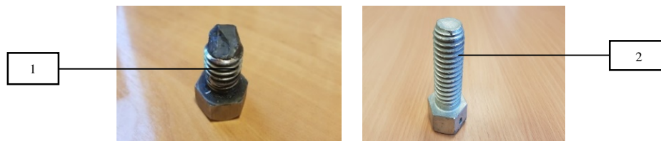
Fig. 2. Rubber-cord bolts, samples M-24: 1 – broken bolt; 2 – new bolt

For these purposes, two bolts were taken, one broken (Fig. 2.1.), the second new (Fig. 2.2), removed from the motor carriage ER2 8029-02. It should be noted that the replacement of the bolts on the ER2 8029-02 carriage was carried out at the TR-3 current repair in September 2018, and in November 2019 one of the 8 rubber-cord coupling bolts broke. It should be noted that the mileage of this carriage from the moment of installation to the kink was 169836 km.